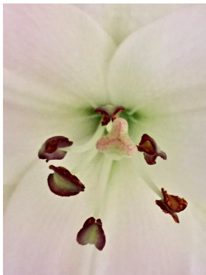
Lily by Audrey Wiechman

Our Friendship Force's Photography Club Cluster submitted three new photos for close-up/macro photography to Friendship Force International Photo Club Clusters in the month of January. Photographers zoomed in close to their subjects.