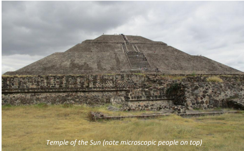
Temple of the Sun (note microscopic people on top)

We still need a few ambassadors to fill this journey - if you have been tempted to join Sacramento's 2019 Outbound to Southern Mexico, now is the time to send me your application! We will visit the most celebrated Museum of Anthropology in the world, we will see pyramids, visit Mayan peoples and learn about their culture, hearing ancient languages being used, enjoy the famous seafood cuisine of Veracruz, boat down rivers and visit forest water falls. This trip will be spectacular!